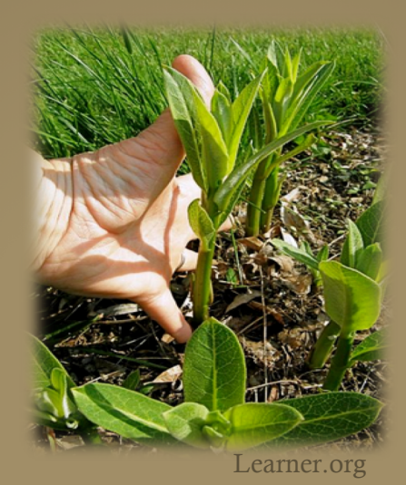
At NWACC, we have designated an area to plant Milkweed for the purpose of demonstrating it's importance to the environment. While our impact here at Northwest Arkansas Community College will be minor, we hope to accomplish a spread of knowledge among the community so that these butterflies and plants are better understood. The more people that know about milkweed plants and their effect on the environment, the better chance we have at making the butterfly species sustainable.