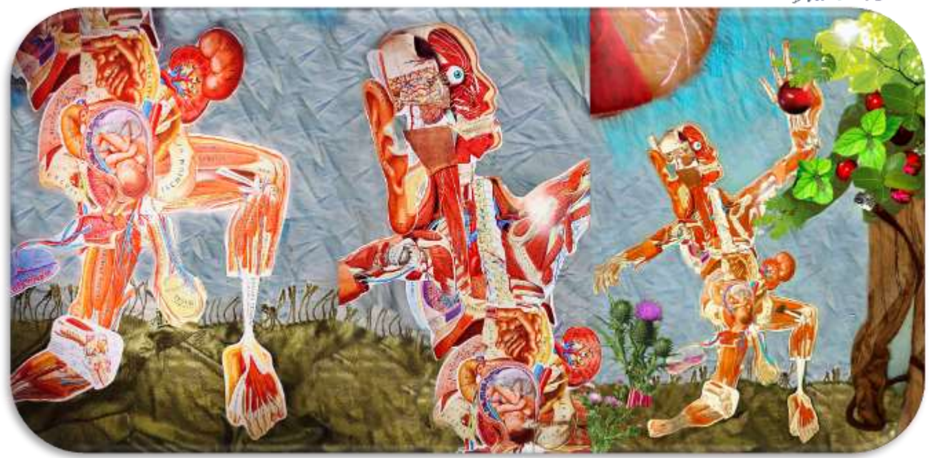
"The most beautiful thing we can experience is the mysterious. It is the source of all true art and all science. He to whom this emotion is a stranger, who can no longer pause to wonder and stand rapt in awe, is as good as dead: his eyes are closed."