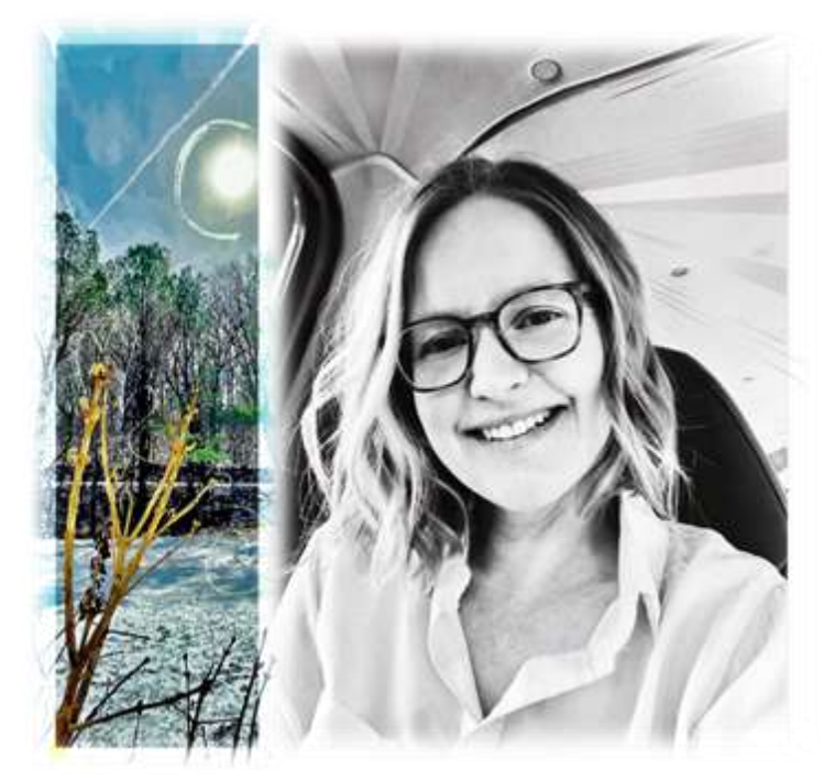
AS – Liberal Arts & Sciences Summa Cum Laude 24 May 2022