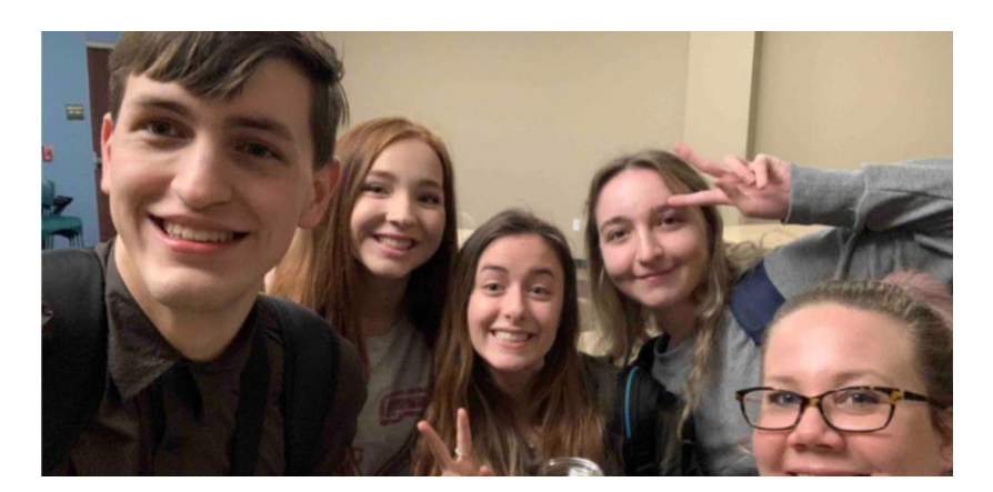
Art and Culture Festival- General Geology I