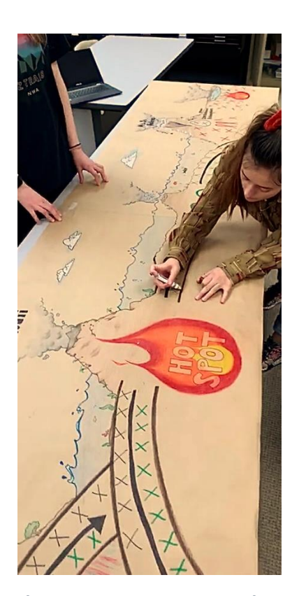
Distribution of Igneous Rocks in Tectonic Framework: Diagram- General Geology I