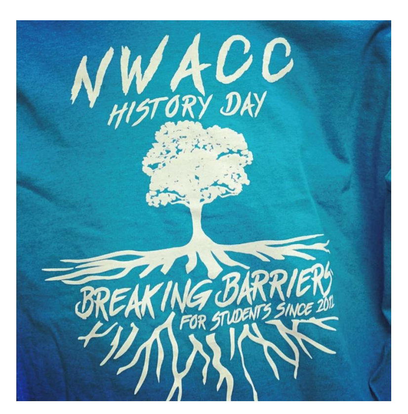
Shirt from History Day- Service Learning