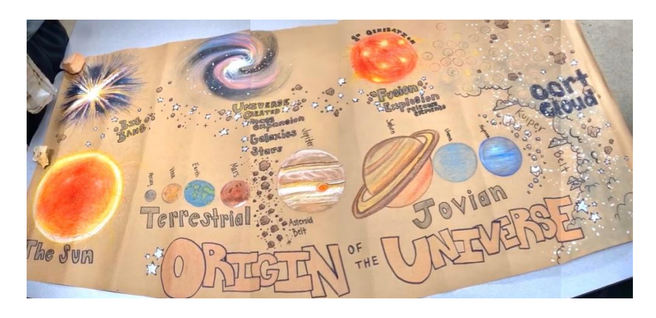
Origin of the Universe: Diagram- General Geology I