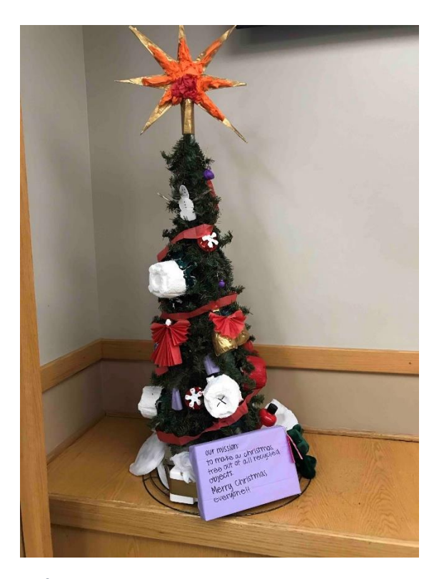
Christmas Tree- Art Appreciation

pieces of craft paper. This took a lot of time, discussion, and panning to create. I am honestly so proud of how much I have grown by taking these four honors classes.