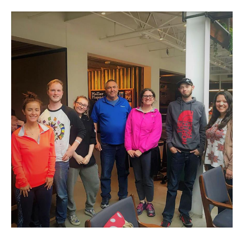
Finals Meeting at The Holler- Composition II