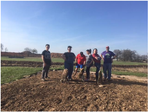
Butterfly Garden at NWACC Spring 2018