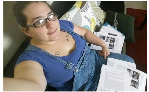
Doing homework in the Honors Study area

English Composition II Introduction to Philosophy History of the American People 1877 to present General Psychology General Sociology