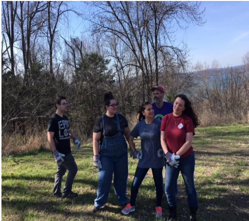
Rocks collected for the Butterfly Garden at NWACC