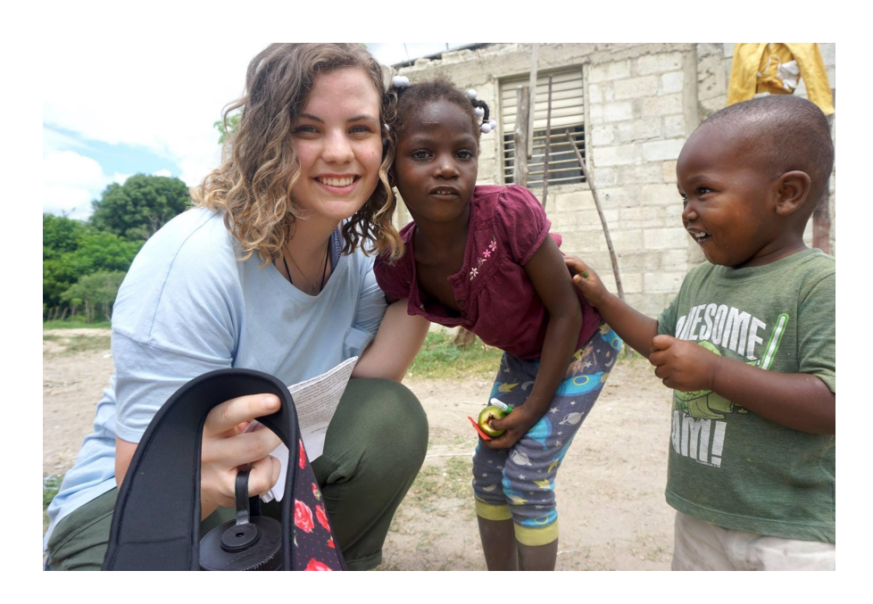
My Service Learning Project helped serve my time in the Dominican Republic. My team and I visited Dominican villages and Haitian Bateyes. Intentional research for the project beforehand helped prepare me for a more accurate and fulfilling cultural experience as a humanitarian.