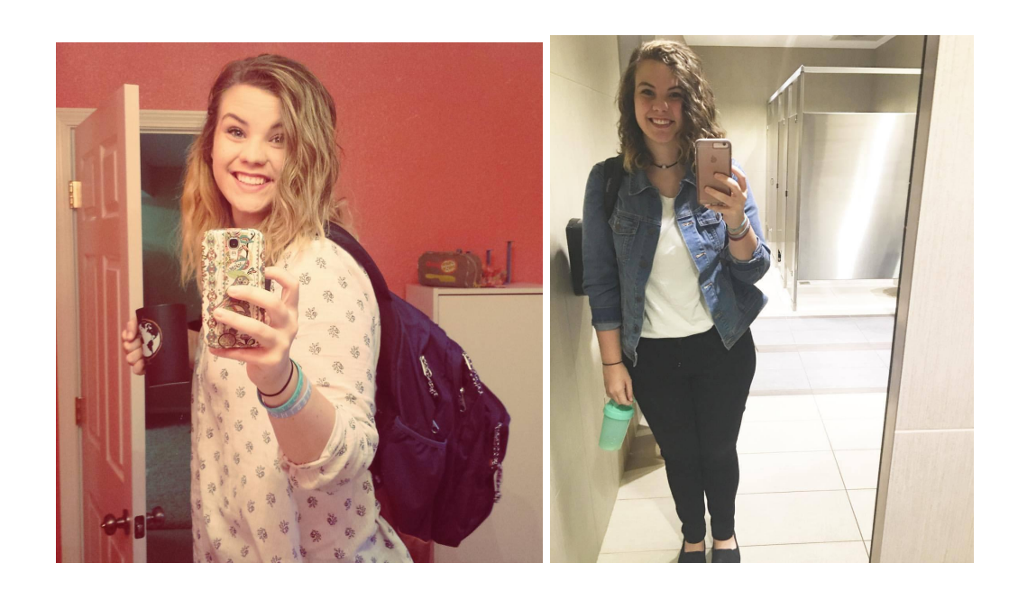
My first day of the Fall 2016 semester and my first fay of the Fall 2017 semester. So much life and learning happened in between these photos, and I have the Honors Program to thank for the most impactful and significant of moments.